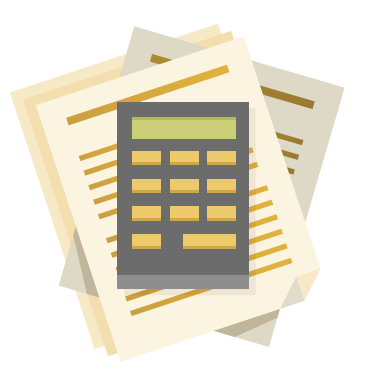
30% of A/R consists of outstanding