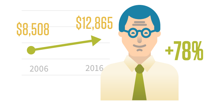
Patient responsibility for family coverage has