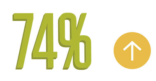
of providers have seen an increase in patient financial responsibility.