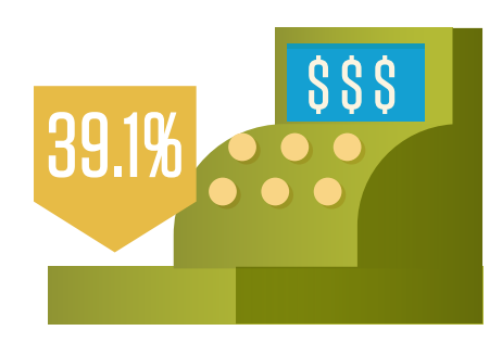
39.1% of privately insured patients have a high-deductible plan.